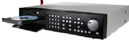
J-2000 Digital Video Recorder

⇒ Video monitoring and recording capabilities are available.