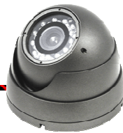
7500 Armor Dome Camera

⇒ System is compatible with most lock systems.